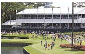
Corporate venues at The Players see early sellout