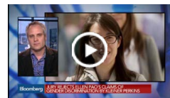
Jury Rejects Ellen Pao's