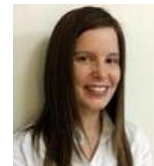
Leigh Starnes Family Nurturing Center of Florida