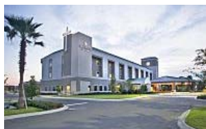
More growth in store for St. Vincent's Clay County location